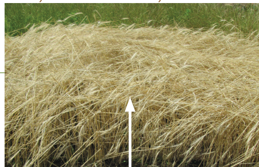
Winter rye three weeks after mid-May termination.

*Visual assessment determined 100% termination after 3 weeks.