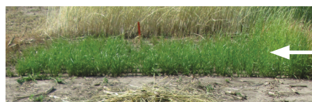
Annual ryegrass regrowth two weeks after mid-May termination.